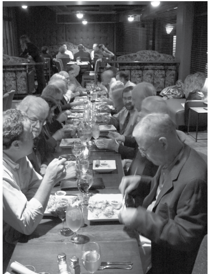
Attendees enjoy the Faculty - Board Dinner at the EPA Annual Meeting on September 29 in New York.